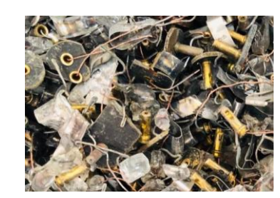
Metal & Plastic